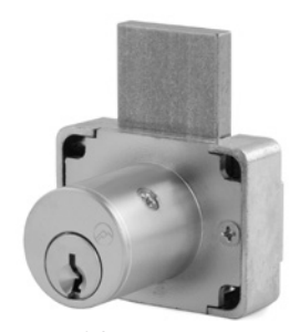
ANSI/BHMA A156.11 Grade 1 E07041

Woodwork Institute (WI) acknowledged product