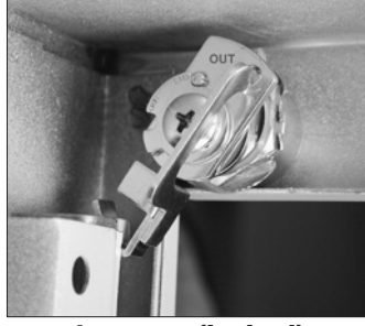
Figure 11 (locked)

The lock is now completely installed. The file cabinet is locked with the cam and gang bar raised to the up position. (Figs. 11 & 12)