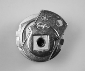
Figure 8 (non key retaining)