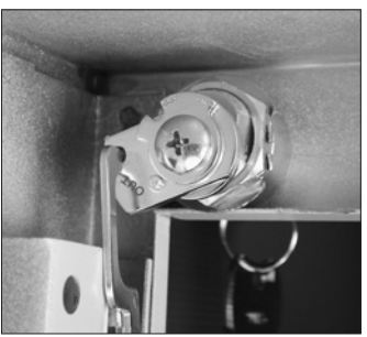
Figure 12 (unlocked)