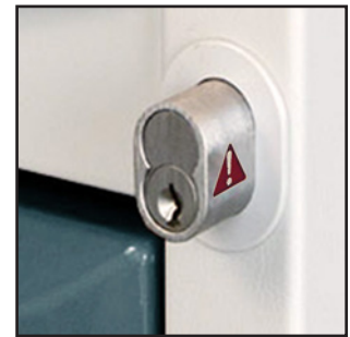
For medical/medication cart use. Red caution flag alerts staff when unlocked.

Applications: Commonly used as a push lock on medical/medication carts or as a file cabinet lock.