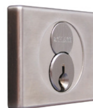
U.S. Patent No. D490,686 S