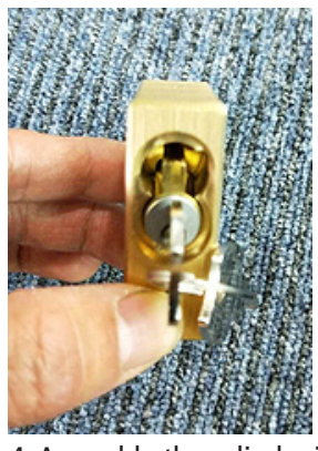
4. Assemble the cylinder into the lock body.