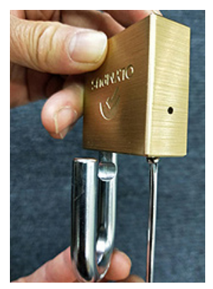
8. Fasten the cylinder by screw.