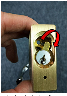
6. Move the cylinder in the clockwise direction when you pull out the key. If the cylinder is in the opposite (counterclockwise) direction, you won't be able to open the shackle when all the assemblies are completed.