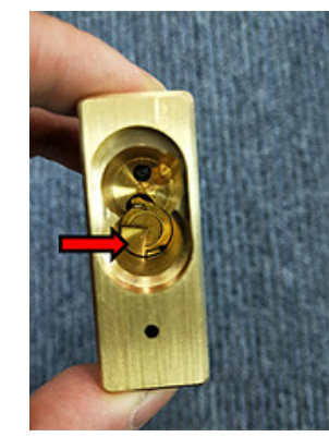
2. Be sure the 1/4 circular bump is at lower-left side as shown in the image.