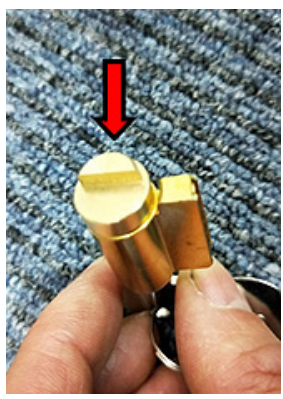
3. Assemble the cap adapter into the cylinder.