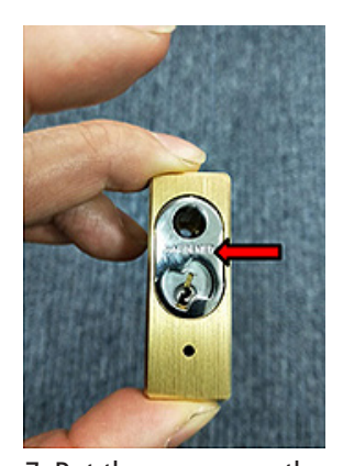
7. Put the cover over the cylinder.