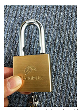
5. Turn the key and the shackle into the unlocked position.